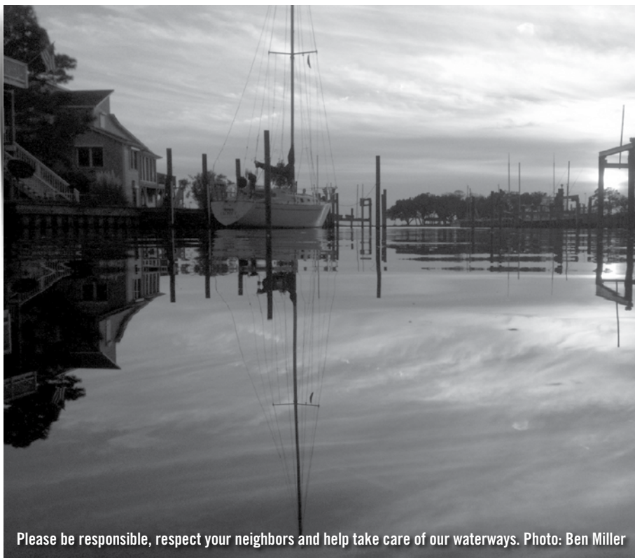
Please be responsible, respect your neighbors and help take care of our waterways.