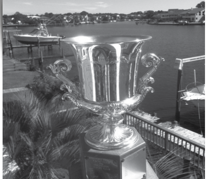
Albemarle Challenge Cup won last year by Colington Yacht Club