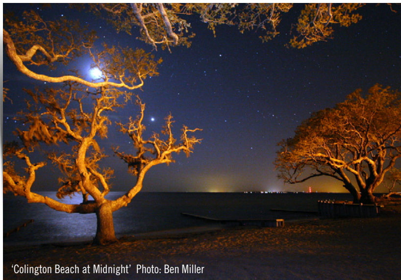
'Colington Beach at Midnight'