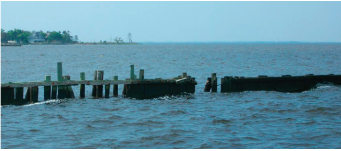
Damaged Condition of the South Timber Jetty - April 23, 2010

Plan 3 has all the characteristics of Plan 2 with the addition of 200' in length to both the existing south jetty and the new north jetty. With this added jetty length and the increased flow of the wind driven current, more of the channel shoaling could be controlled.