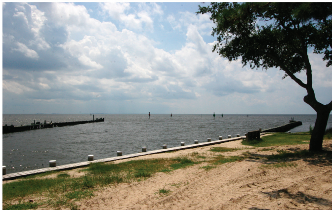
Colington Harbour Inlet Jetty