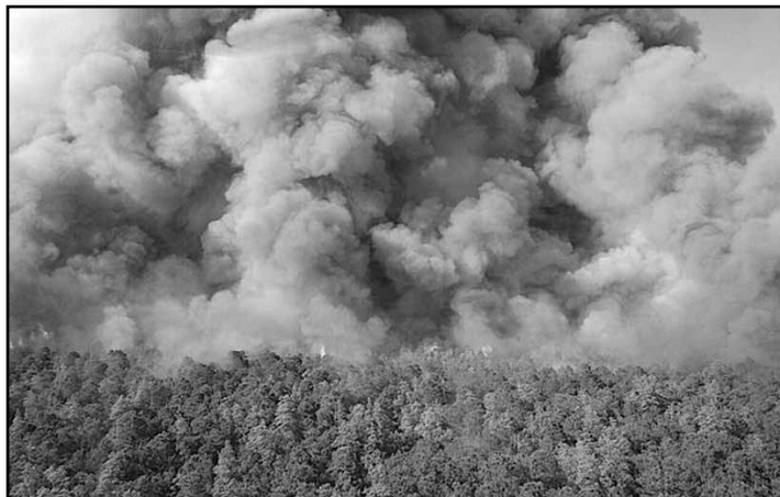
Smoke from a recent burnout next to the Navy Dare Bombing Range sent billows of smoke into the air.

State air-quality officials continue to issue unhealthy air quality advisories for various portions of the eastern part of the state as smoke from the Pains Bay Fire on Alligator River National Wildlife Refuge and the Dare Bombing Range continues to burn.